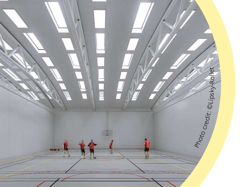
TABLE TENNIS AND PARA TABLE TENNIS HALLS